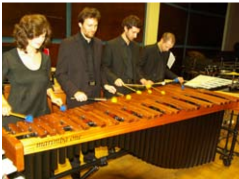
Quatror Puls' At Maurice Ravel Conservatory, Paris