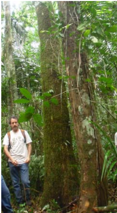
Ron is looking for the perfect wood that sings.

This is the process, for example, used to create Marimba One's